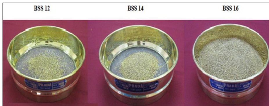
Fig 1: Different sieves used for grading seeds of little millet cv. CO (Samai) 4