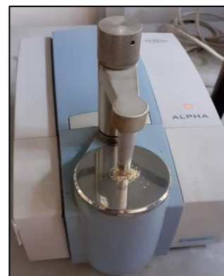
Fig 2: Spectrometer

The delignified fibres were analysed using Fourier Transform Infrared Spectroscopy Phase- II Spectrometer (Fig. 2). The powdered sample of dhaincha fibres was used for analysis. The FTIR spectra was obtained using Bruker software and was further analysed for establishing functional groups in dhaincha fibres before and after delignification process.