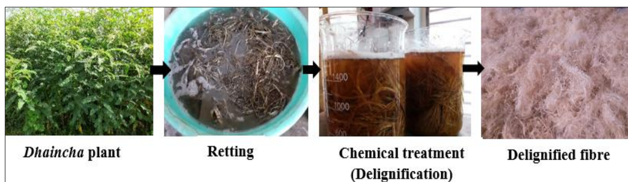
Fig 1: Steps in processing of dhaincha fibres

The stems of dhaincha plant about two and half months old were collected from Crop Research Centre, Govind Ballabh Pant University of Agriculture and Technology (G.B.P.U.A.T.), Pantnagar, Uttarakhand, India. The ribbons of the dhaincha stalks were retted for 15 days and further treated chemically (Fig. 1) using delignification process (Ilyas et al. , 2017) [6]. The treatment focussed on removal of components like lignin, hemicellulose, pectin, etc. The chemical reagents used in the study for lignin removal from dhaincha ribbons were sodium chlorite ( \text{NaClO}_2 ), acetic acid ( \text{CH}_3\text{COOH} ) and sodium hydroxide ( \text{NaOH} ).