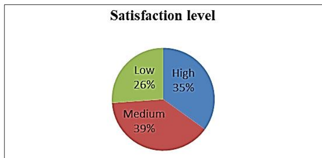
Fig 3: Farmers satisfaction level