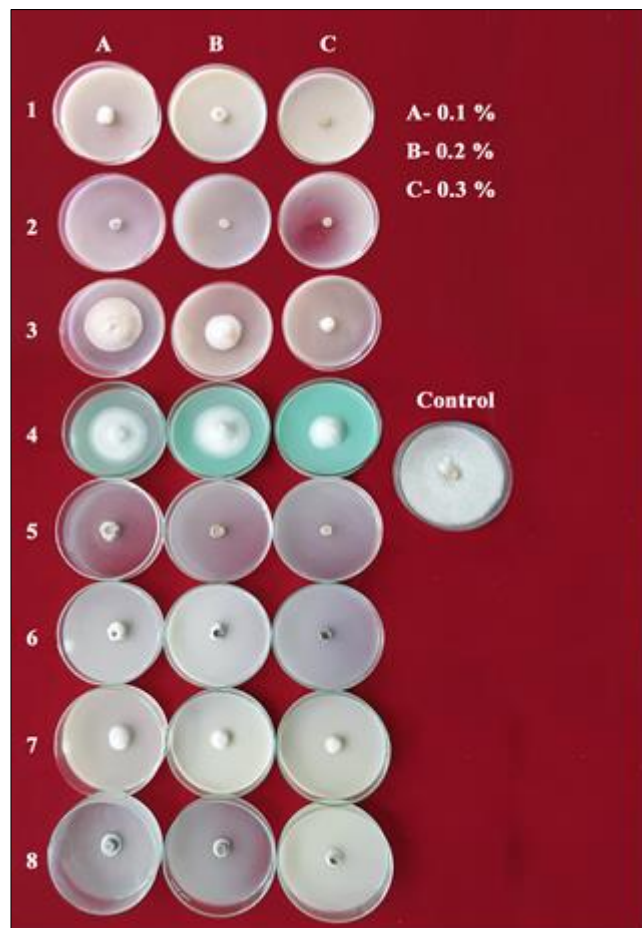
Plate 3: In vitro efficacy of combi – fungicides against C. gloeosporioides of mango