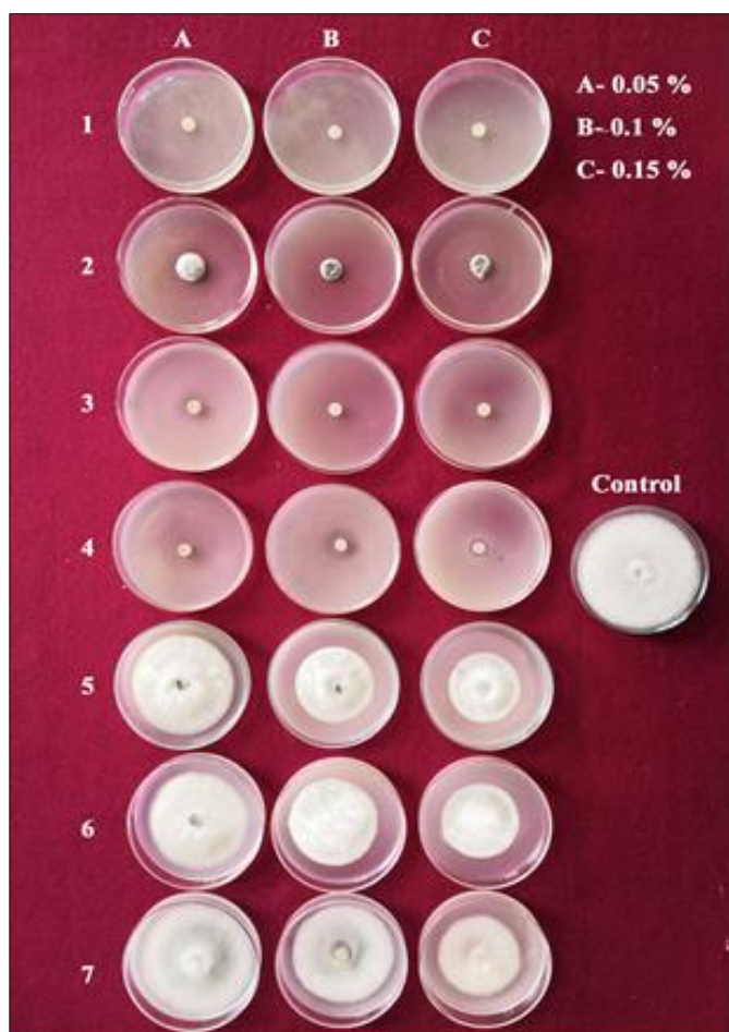
Plate 1: In vitro efficacy of systemic fungicides against C. gloeosporioides of mango

*Figures in parentheses indicate angular transformed values