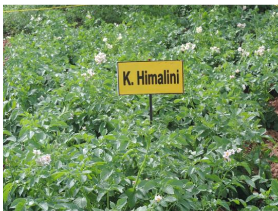
Fig 5: Kufri Himalini plot view