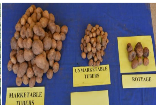
Fig 4: Kufri Lima tubers