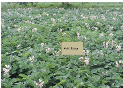
Fig 3: Kufri Lima plot view