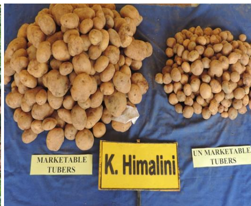
Fig 6: Kufri Himalini tubers