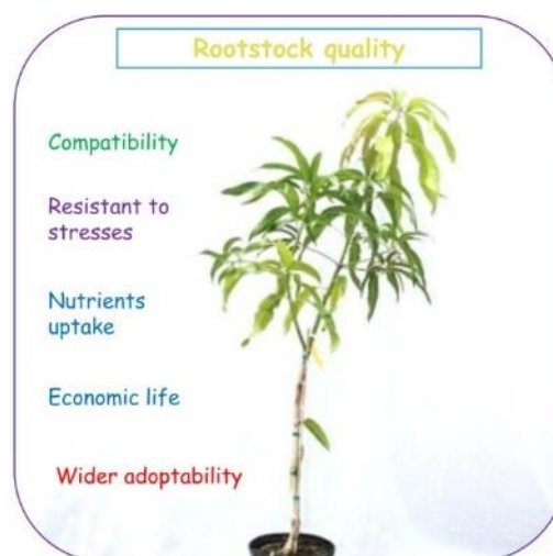
Fig 5: Quality of Rootstock