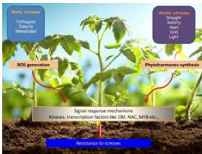
Fig 2: Rootstock resistance mechanism