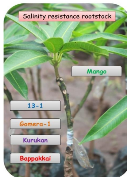
Fig 4: Salinity resistance rootstock

resistance to stresses, nutrient uptake, economic life and wider adaptability (Fig.5).