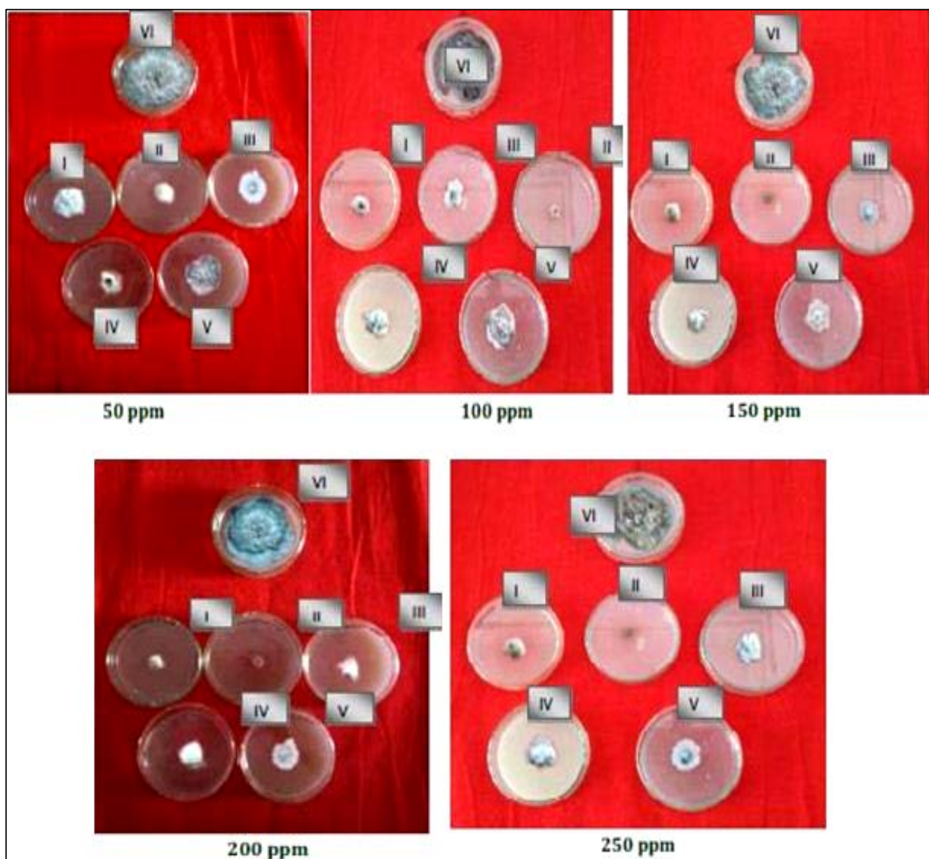
Fig 1: In vitro inhibition of fungicides at different concentrations against H. maydis

*Mean of three replications, G= Mycelial Growth (mm); I= Inhibition Per cent