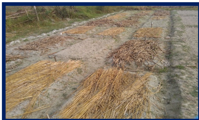
Fig 1: Photograph Showing the Details of Different Treatments