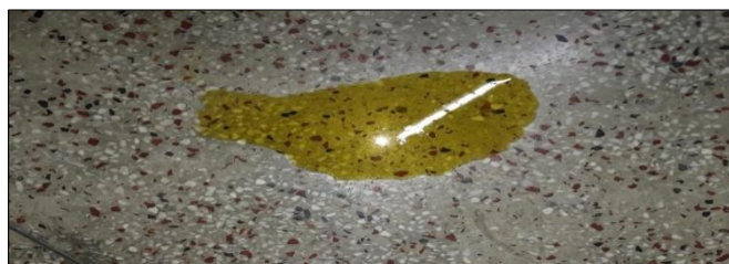
Fig 1: Dark yellow cloured urine by a liver compromised dog

Figures in parenthesis indicate percentage. (n) refer to number of dogs.