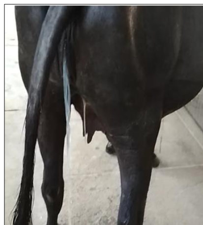
Fig 2: Passage of syrupy, viscid amniotic fluid