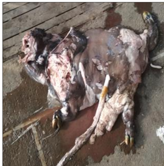
Fig 3: Bull dog calf monster