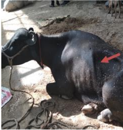
Fig 4: Broken ribs in the affected dam