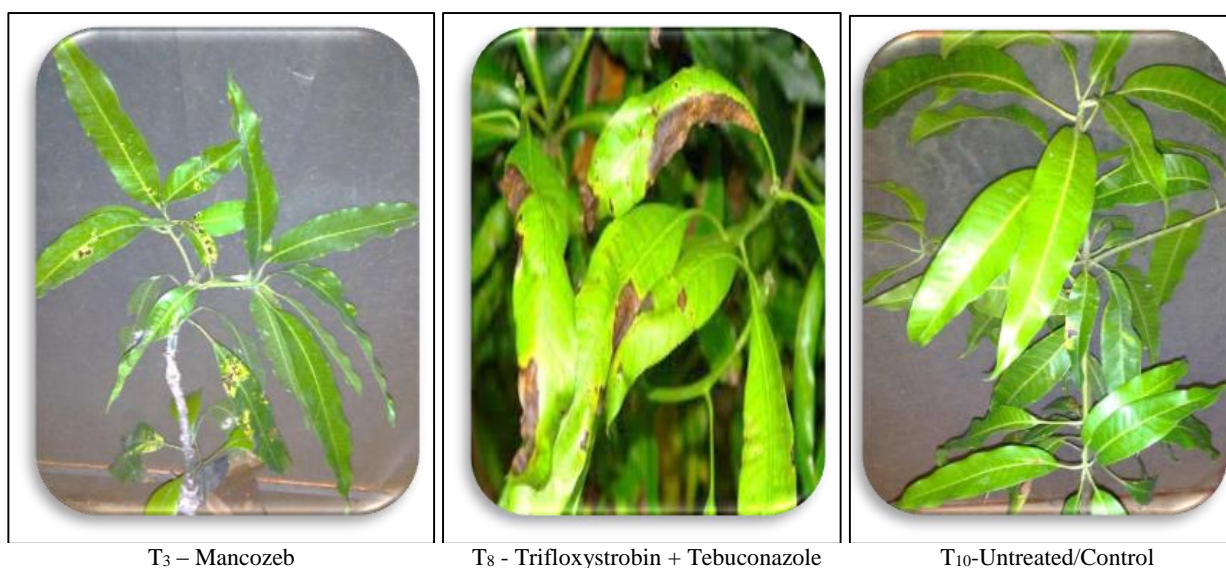
T 3 – Mancozeb