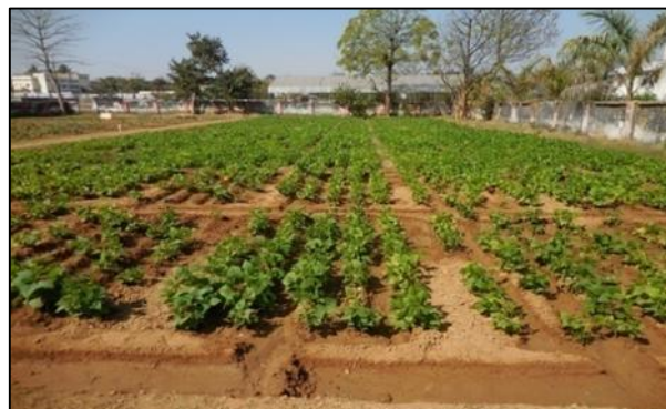
Effect of seed treatment of with fungicides on root rot incidence ( R. solani )