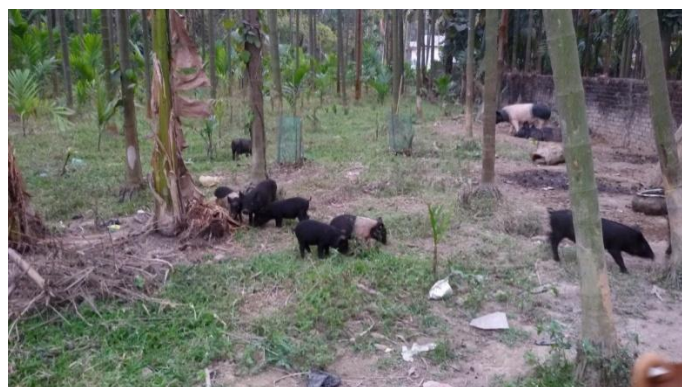
Fig 4: AI born piglets under field condition.