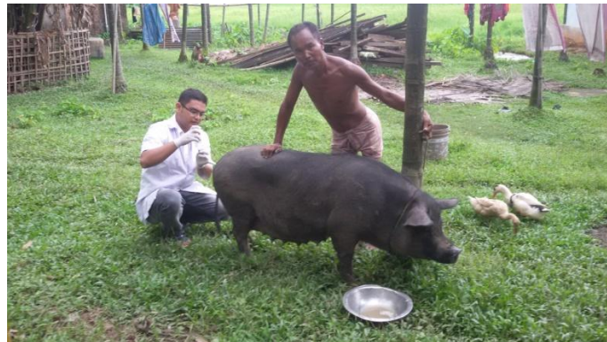
Fig 3: Deposition of extended and preserved semen in a female pig with an AI catheter.

The boars were reared in AICRP on pig, Khanapara maintaining hygienic conditions that fulfill the norms required under Institutional Animal Ethics Committee.