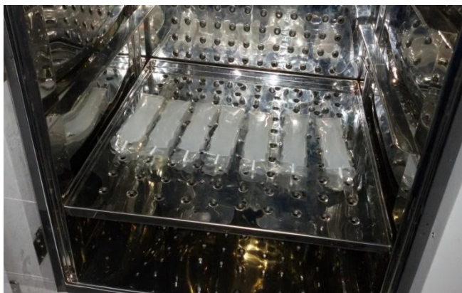
Fig 1: Preservation of boar semen (A.I. doses) in a BOD incubator.

The semen samples having more than 85 per cent initial sperm motility and live sperm having minimum sperm concentration of 200 million/ml were used for preservation. The suitable semen samples were diluted with Modena extender (Moretti J, 1981 [6] ) @ 1:4 and hold for four hours in incubator at 22° C. After the holding period, the semen samples were preserved in BOD incubator at 15°C. For artificial insemination, semen doses were prepared in plastic sachets procured from IMV Technologies, France. 75 to 100 ml of extended semen containing 2.5 to 3.0 billion motile sperm was maintained in a semen dose. The semen was transported in a specialized cool cabinet operating at 15° to 18° C or an insulated box to the field for artificial insemination.