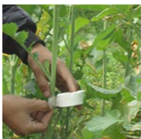
Wrapping of tap in inoculated stem