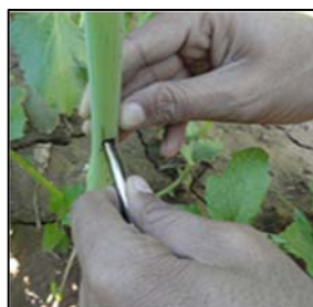
Formation of hole in stem through cork borer

sclerotia was placed with the help of cotton and it was covered with cello tape so that it remain in the contact with the stem.