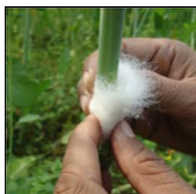
Wrapping of cotton on inoculated stem