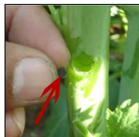
Sclerotia placed in bordered stem