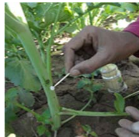
Placement of mycelial bit inside bordered stem