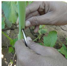
Formation of hole in stem through cork borer

In this method the stem of 45 days old mustard plant was scratched at the height of 10-12" from soil level. On the scratched portion the mycelial bits of S.sclerotiorum was placed with the help of cotton and it was covered with cello tape so that it remain in the contact with the stem.