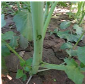
Hole are formed in stem