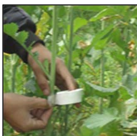
Wrapping of tap in inoculated stem