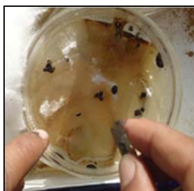
Sclerotia in Petri disc