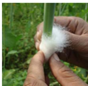
Wrapping of cotton on inoculated stem