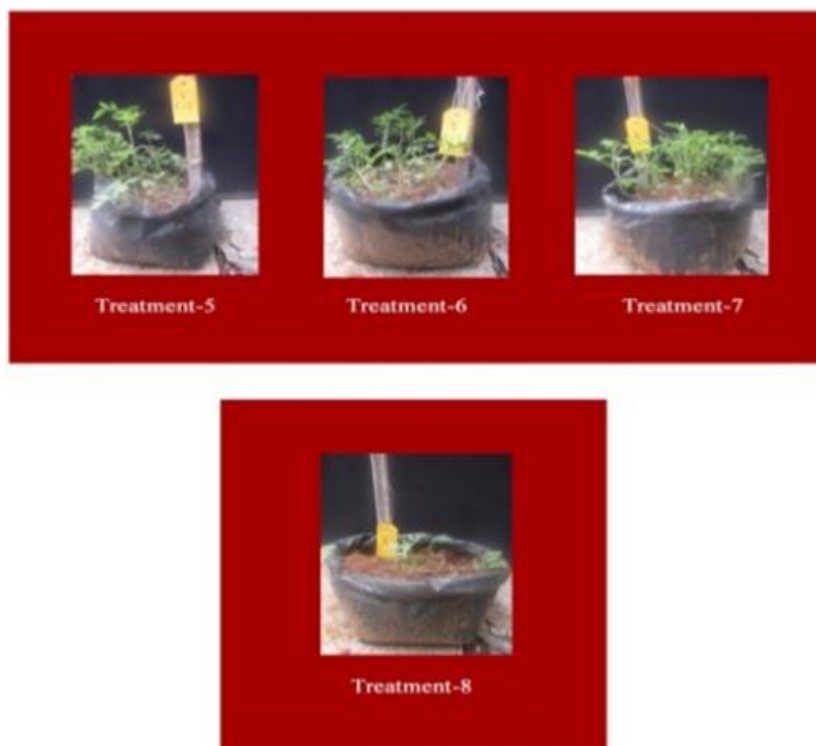
Plate 1: effect of biocontrol agents on management of damping off caused by Pythium debaranum on tomato cv Arka Vikas at 50 days.

The reduction or suppression of damping off incidence by bio-control agents maybe due to production of hydrolytic enzymes secreted by bio-control agents which help in entry of antagonists to pathogens through penetration with direct lysis and degradation of cell walls as reported by Chet and Baker (1981) [1]. Similarly Elad et al. (1987) [3] also reported the ability of Trichoderma isolates to control P. aphanidermatum , S. rolfsii in soil was achieved through hydrolytic enzyme production. It is evident from the results that the application of antagonists in combination showed synergistic effect on P. aphanidermatum .